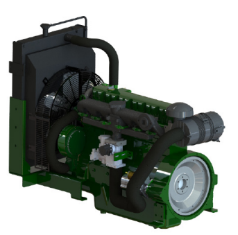
Image shown is for illustration purposes only and may not be an exact representation of the final product.

Weight, physical dimensions, and power ratings are for reference only. Final product data may differ slightly.